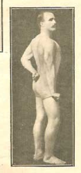
SHOWING BENEFIT GAINED ON THE "ASTON" SYSTEM.